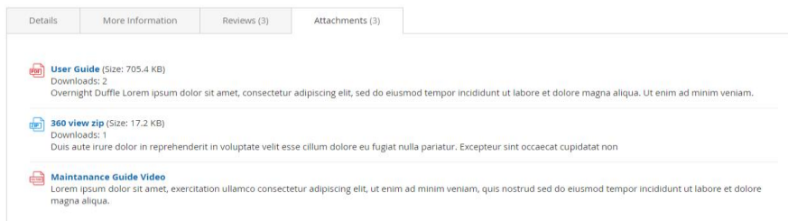
Figure 6 – Product details page attachments in Tab View