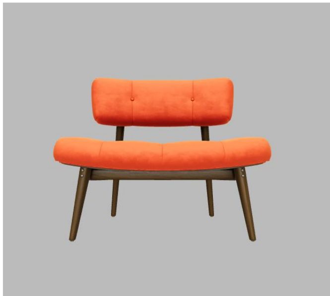
Figure 4: 3D Product View