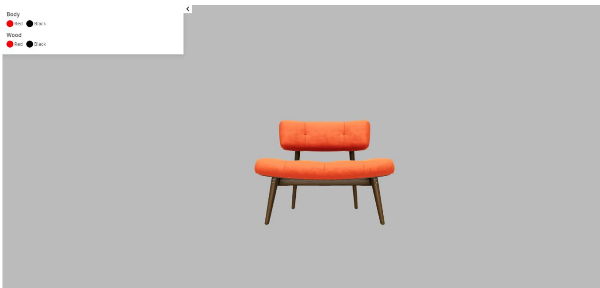
Figure 5: 3D Product View Popup