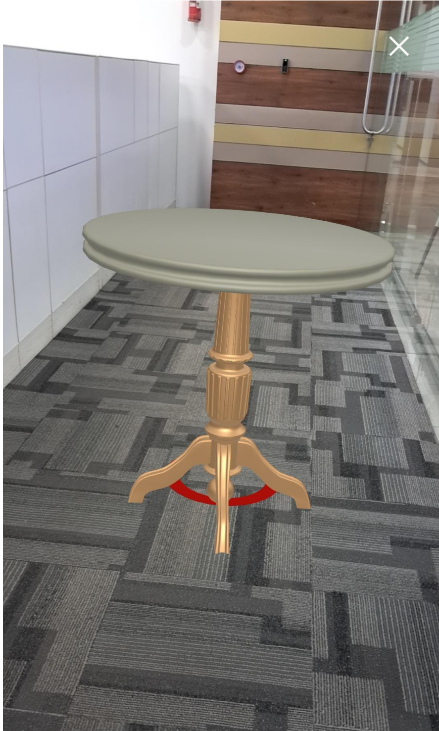
Figure 5: AR Product View

Note: This extension supports only simple and configurable products and its child products. Also, please add the 3D file with coordinates set to (0,0,0) for a better view.