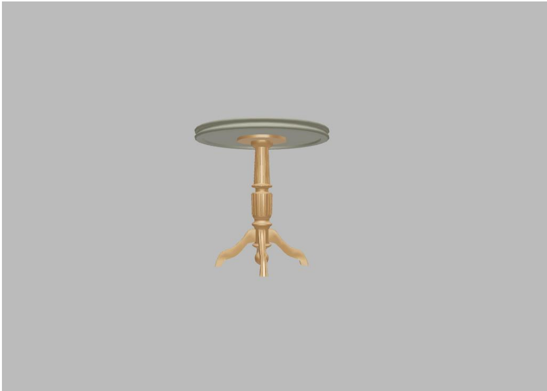
Figure 4: 3D Product View Popup